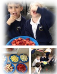
Y1 Fruit Tasting