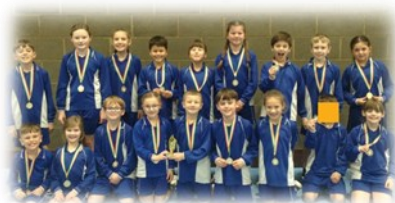
Y3/4 Athletics Competition

In school, Year 4 had the opportunity to try Boccia, an all-inclusive sport that forms part of the paralympic games, led by a representative of the school Sports Partnership.