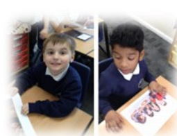
Year 1- Reflecting on the religion Islam and Eid celebrations