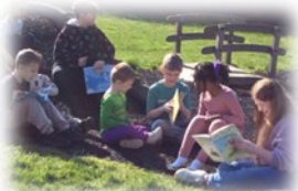
EYFS and Y5 share stories on World Book Day