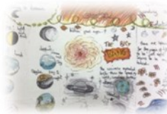
Y6 explore different accounts of creation