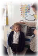
Y3 In Car Safety Workshop