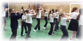
Y5 South American Dance Workshop