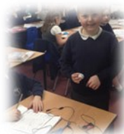
Y4 Identifying electrical conductors