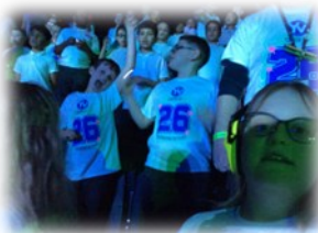
Y4 and Y5 Young Voices