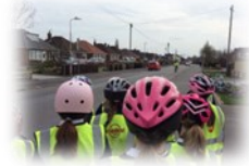
Y1 Walk to St Thomas' Church