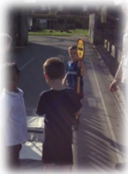
Year 1 Walk Safe Workshop

TOP TIP- Parents/Carers please check your child's phone.