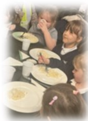
EYFS Chinese Restaurant Visit