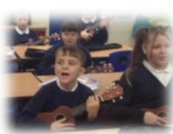
Y4 Learn chords on the ukulele