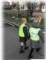
Road safety partnership