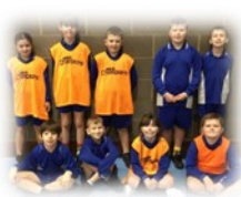
Change for Life event