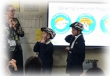
Y5 Helmet Safety Workshop