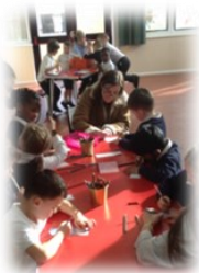
Sharing reading with parents.

As part of the Music curriculum, Year 4 performed at Sheffield Arena at the Young Voices Concert with over 8000 children. What a pleasure and incredible experience it was to be part of! The children really were able to demonstrate the core values and share their talent for singing.