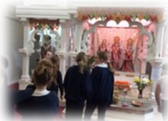
Y5 Visit the Hindu Mandir