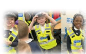
EYFS PCSO visit

See our class webpages to learn more about these visits.