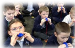
Y1 learn to play the ocarina