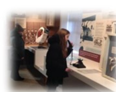
Y6 trip to Duxford Memorial Museum