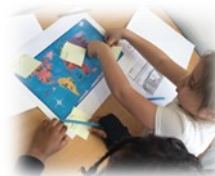
Y2 use an atlas to locate the continents

Encouraging each other, overflowing with hope.