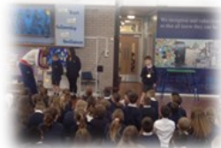
Olympic Athlete Visits School

Encouraging each other, overflowing with hope.