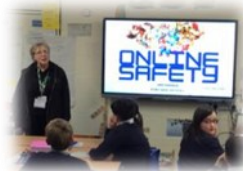
Online Safety Day including Workshops for years 2-6 over the term